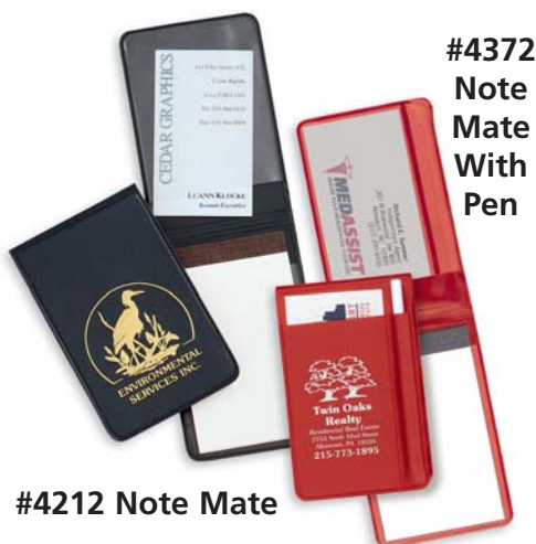
#4212 Note Mate

Quality products that work for you in any environment!